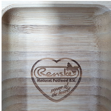
example to show the engraving style